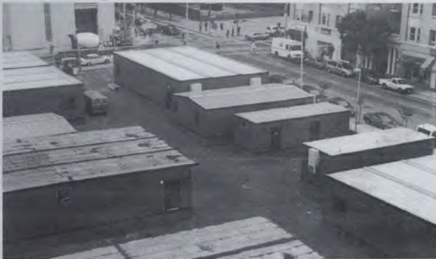
Photo of current parking lot re-touched to show possible design of "futuristic" rent-by-the-hour motel to be run by Hastings.