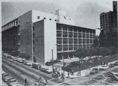
The Munson Award committee noted that the "Cuban missile crisis" style architectural design helped Hastings beat out the competition. The fact that the southwest corner of the building was completely devoid of windows also caught the eyes of the committee. The Law Ruse believes the Ford Pinto stationwagon out front had something to do with it.